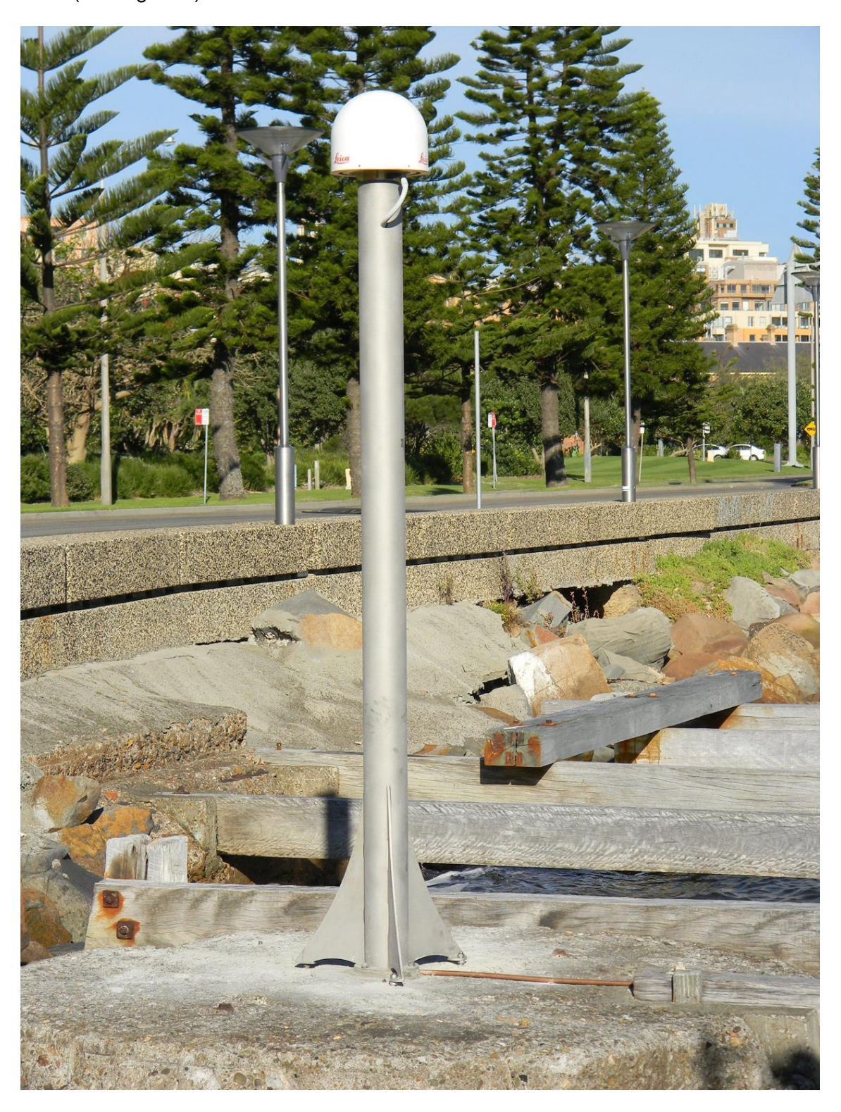
Figure 3: Newcastle East CORS pillar (including CAAM).

Following attainment of all relevant approvals, facilitation of all necessary heritage considerations and rigorous, successful pre-testing of alternative hardware setups, the Newcastle East (Pilot Station) CORS was constructed and became operational on 26 June 2012 (see Figure 3).