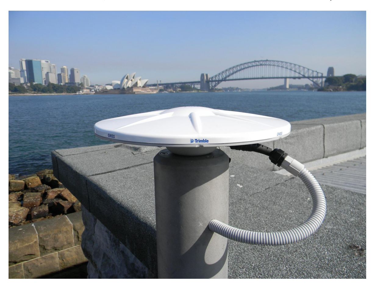
Figure 2: Fort Denison CORS antenna mount (including CAAM).

A new pier for the antenna was considered but, in consultation with a wharf construction contractor, was discounted as the required stability could not be attained given the area's tide surge characteristics and relatively shallow bedrock (i.e. a pile could not be driven into unconsolidated material, nor could a concrete foundation be made on the surface).