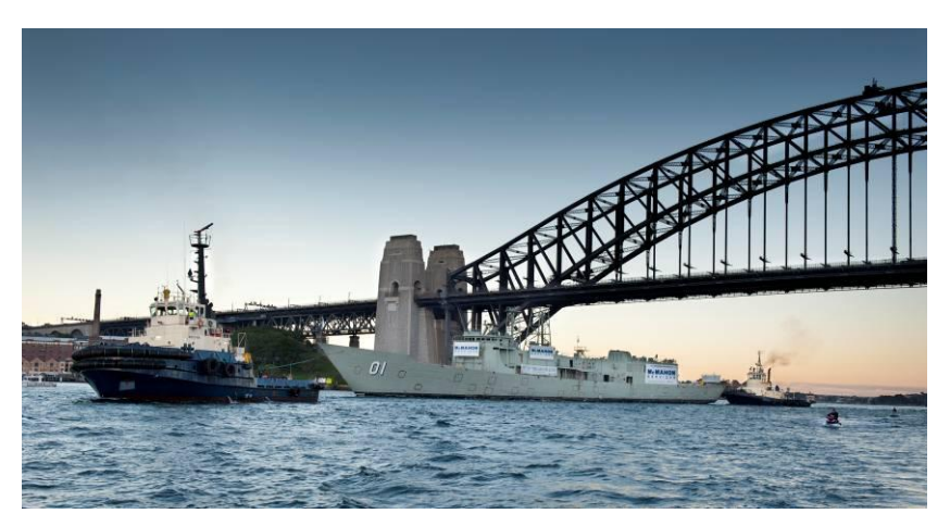
Figure 7: Departing Sydney Harbour on 10 April 2011

The project had been delayed by over 12 months and costs had increased significantly due to the time delays and the additional work required by the Tribunal's conditions. However, the culmination of the project was finally in sight with new dates set for the tow on 10 April 2011 and scuttling on 13 April 2011, provided weather conditions were suitable.