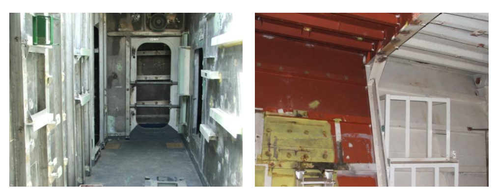
Figure 6: The underlying surfaces after removal of insulation

The additional work was inspected by the Department of Sustainability, Environment, Water, Population and Communities (DSEWPC, the successor to DEWHA) in March 2011 and DSEWPC verified compliance with the additional Permit conditions imposed by the Tribunal.