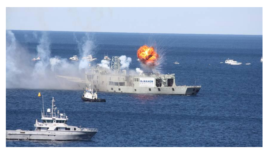
Figure 9: Scuttling pyrotechnics

The Ex-HMAS Adelaide was scuttled on 13 April 2011 at approximately 11.48am. The plan was to scuttle at 10.30am, but some friendly dolphins came for a look and the scuttling had to be delayed until they had left the area! The ship took about 2 minutes to submerge.