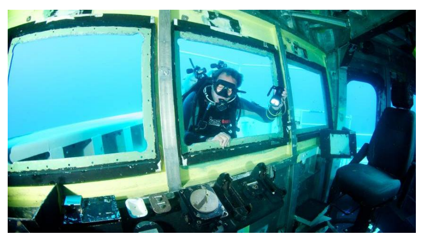
Figure 11: The bridge and captain's chair

Key features that have been retained on various decks of the wreck include the Bridge with the captain's chair, the helicopter hangars, the operations room with the shell of various weapon and sensor consoles, torpedo racks, the crew's cafeteria, sick bay and a limited number of bunks and amenities.