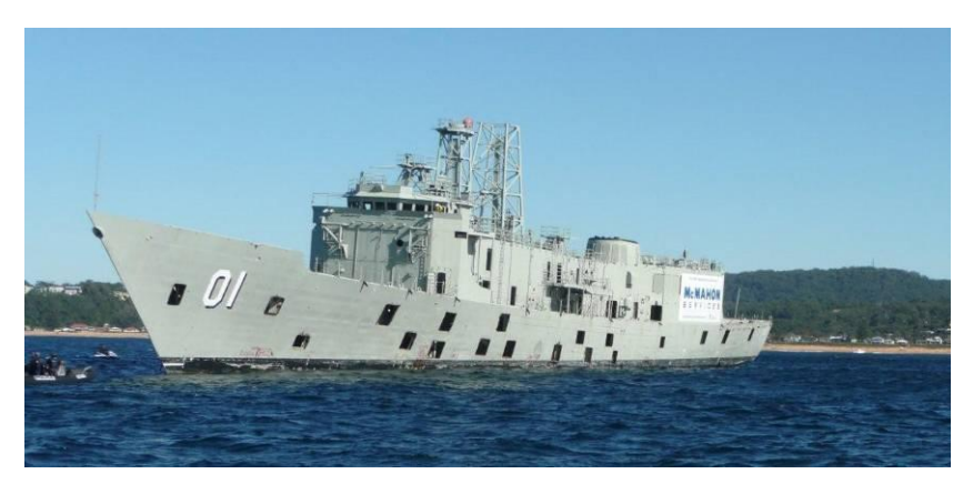
Figure 8: Ready for scuttling, showing precut holes above the waterline

The Ex-HMAS Adelaide was scuttled on 13 April 2011 at approximately 11.48am. The plan was to scuttle at 10.30am, but some friendly dolphins came for a look and the scuttling had to be delayed until they had left the area! The ship took about 2 minutes to submerge.