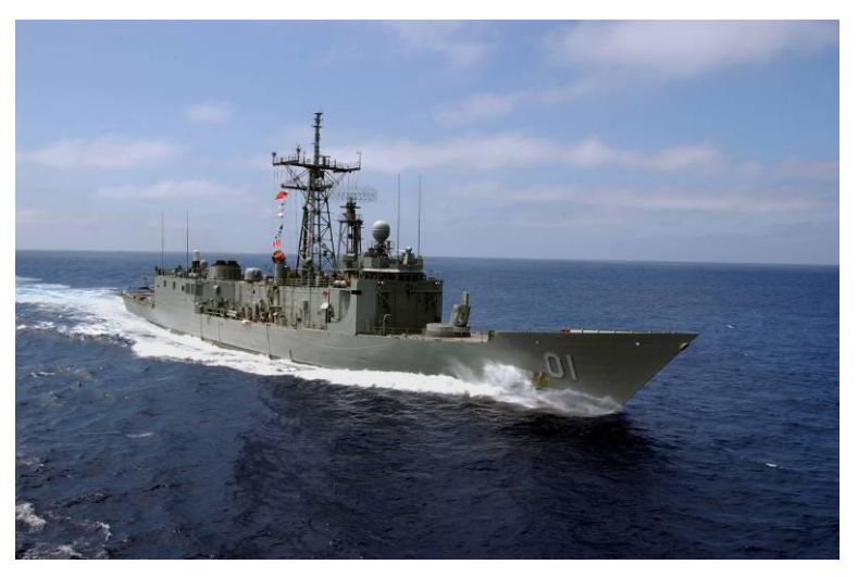
Figure 1: The Ex-HMAS Adelaide in service

Built in the United States, HMAS Adelaide was commissioned in November 1980 and was the first of six Adelaide-class guided-missile frigates to be delivered to the Royal Australian Navy. The 138-metre long ship was decommissioned in 2008 and demilitarised by the Department of Defence before being handed over to the NSW Government in 2009.