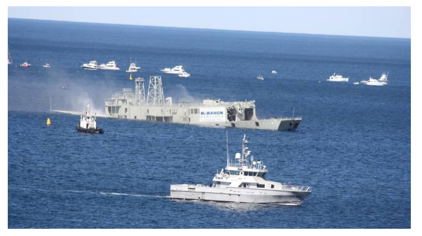
Figure 10: Down she goes...