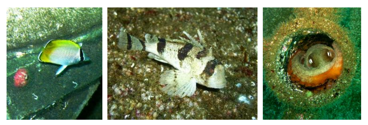
Figure 12: Some of the marine life already seen on the Ex-HMAS Adelaide

One of the current research projects is investigating the ship's performance as an artificial reef, including monitoring of fish colonisation and whether fish are recruited from other nearby reefs or if there is a net increase in the number of fish in the area.