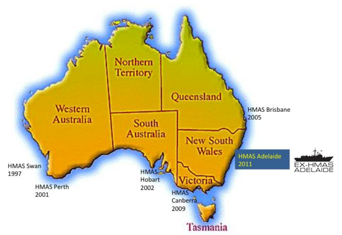
Figure 2: Location of naval wreck dive sites in Australia